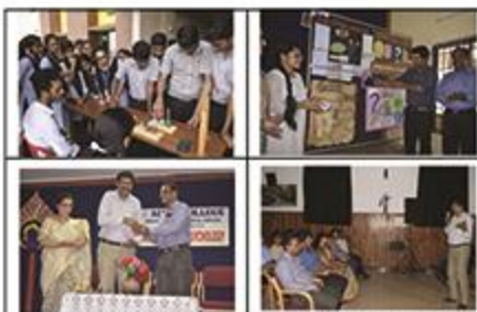
Top photos are of exhibition and the below are of guest talk

chief guest of the function. The department of Psychology showcased chart made by psychology students of UG and PG and also the participants of 'Poster making' competition. Various types of apparatus demonstration and tests were conducted. Also