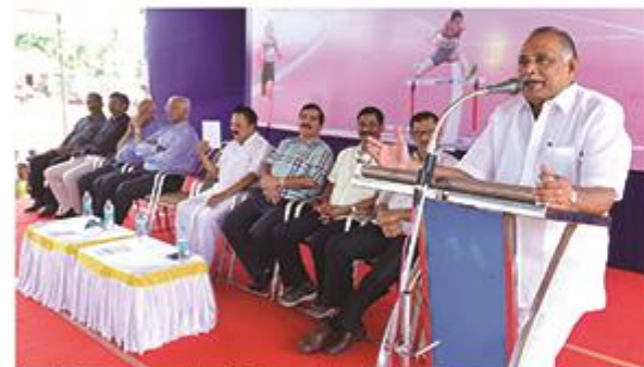
The dignitaries at the National level athletics meet at Swaraj Maidan in Moodbidri.