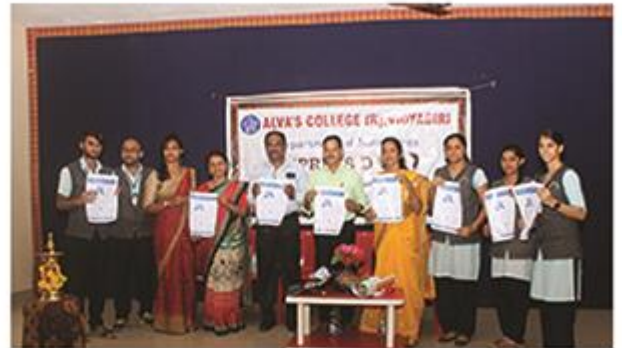
Release of Alva's Madhyama by the guest.