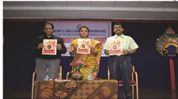
Chief Guest releasing the Humanity Review

Speaking on the occasion he said the development in the 20th century brought about major changes in the field of social science. He spoke widely on the topic quoting great thinkers of the world