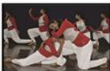
Dance performance by Naturopathy students

Vidyagiri: Mental health is sound fitness in the mind. It is in fact the crown of all kinds of healthiness. A healthy mind is a healthy physique and a healthy physique creates a happy self. In the year 1992, the world health organisation first observed the mental health day on October 10th, thereby the world has been observing