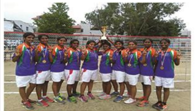
* Winning team posing with the trophy

Moodbidri, 20th June : The Indian Ball Badminton Association and the Delhi Ball Badminton Committee held the 4th National Inter-state Ball Badminton tournament at Moodbidri. The girls of Karnataka won the Championship for Karnataka. Many of the girls from Moodbidri Alva's college played for the Karnataka team and finally they beat Tamil Nadu 35-22.