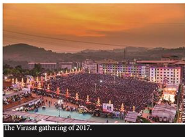
The Virasat gathering of 2017.

years. Virasat is a vivid display of talents by Classical and Folk artists both from the country and abroad. The objective is to familiarize these programmes to the local art lovers by making them view and appreciate the arts displayed. Inculcating and improving the aesthetic taste of the audience is one more rationale behind this. Prominent names like Ms. Sonal Mansingh, Ustad Zakir Hussain, S.P. Bala Subramanyam, Kadri Gopalanathan, Dr. Balamuralikrishna, Dr. K.J. Yesudas, Pt. Ajay Chakraborty, Padmabhushan Dr. Padma Subramnyam have performed here and have been awarded the prestigious Alva's Virasat Award. More than 70,000 audiences, both domestic and foreign who come exclusively to watch this programme live on daily basis and more than 20 lakhs audience watch on television. The programme can also be watched live in through the official Alva's Virasat