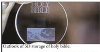
Outlook of 5D storage of holy bible.

oped the recording and retrieval processes of five dimensional (5D) digital data by femtosecond laser writing. The storage allows unprecedented properties including 360 TB/disc data capacity, thermal stability up to 1,000°C and virtually unlimited lifetime at