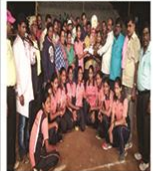
* The Kabbadi team