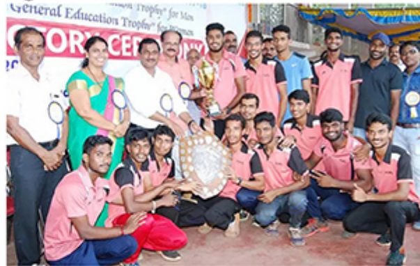
Alva's team with the trophy