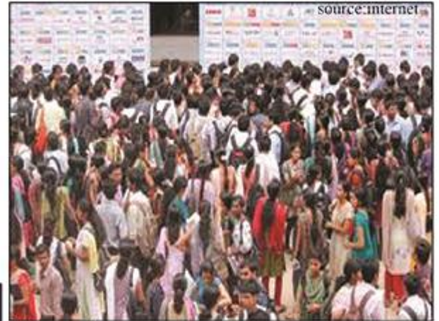
This year witnessed a mass gathering of students for the event.

"It is basically the commitment and driven purpose of making students knowledge and skill oriented that has boosted Pragathi. It has been a great platform for graduates. Success of Pragati is solely because of the team work and unconditional support."