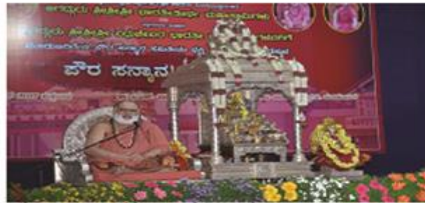
* Shringeri seer addressing the crowd

On 30th, in the preaching session, addressing the students he said, The respect and name that comes from having money remains only till you have money, as soon as the money vanishes the respect and name vanishes with it. The