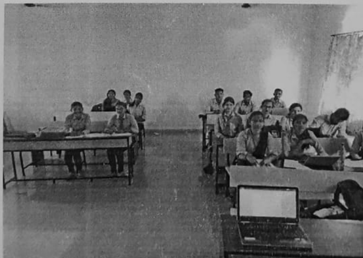
Participants of guest lecture