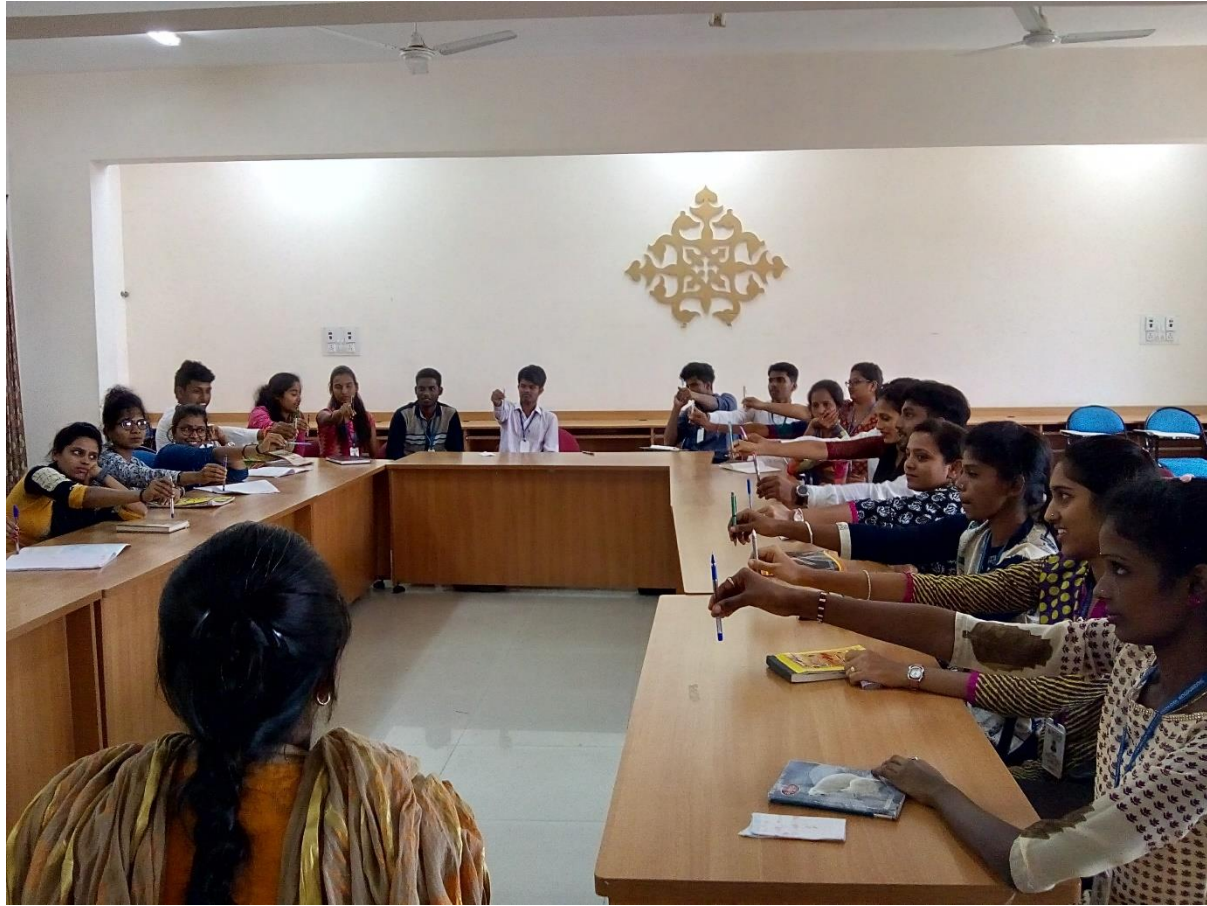
Activities on skill development