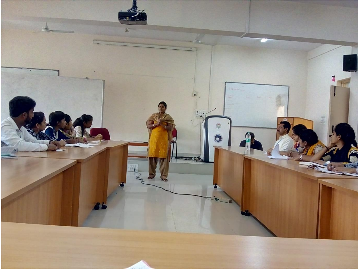
Session on the organisation & its functions.