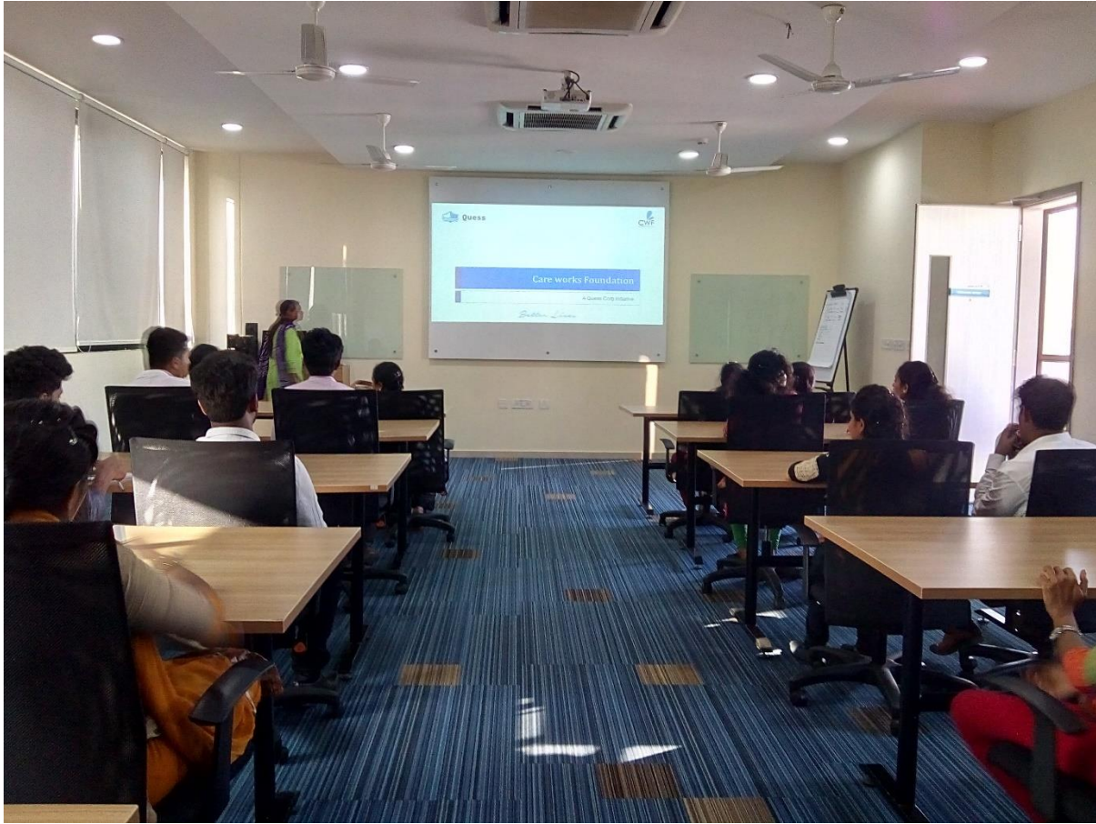
Session about CSR activities of Quesco