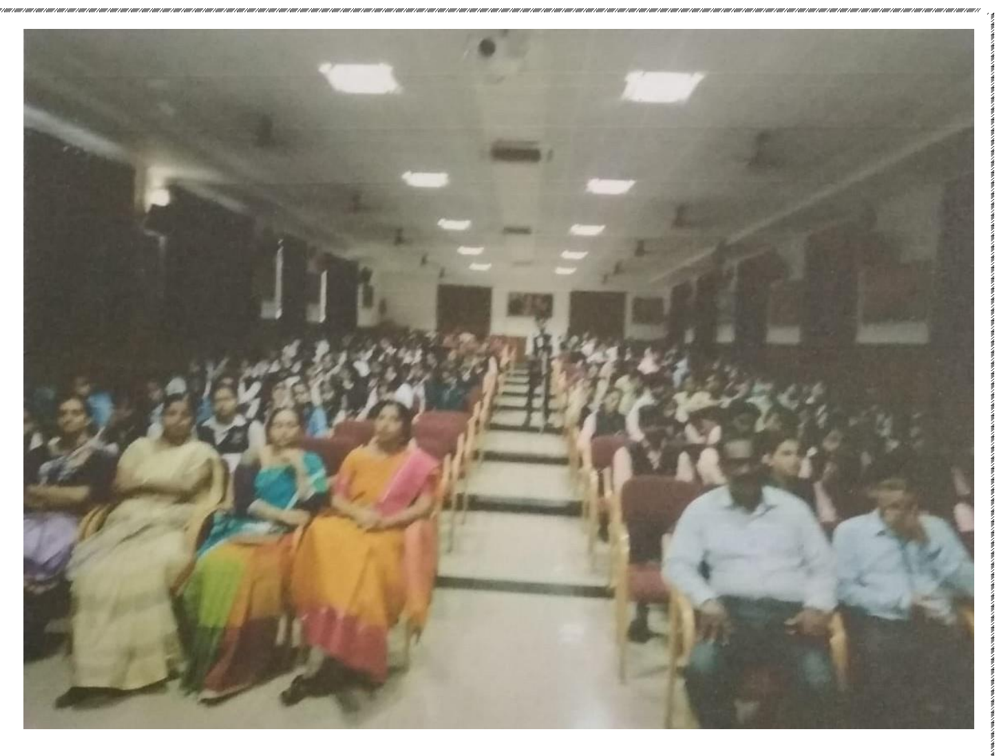
Participants in the Workshop

There are around 170 members have participated in the workshop including the faculty members and students of various departments from both UG and PG.