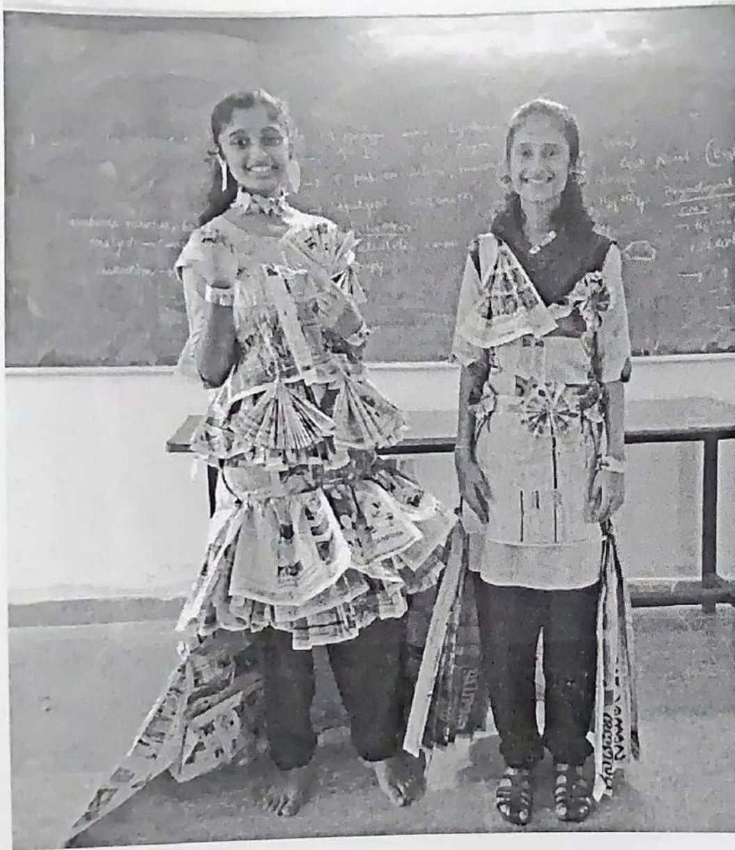
Inter Forum Competition.