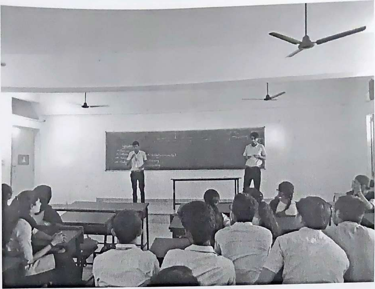
A forum hour.