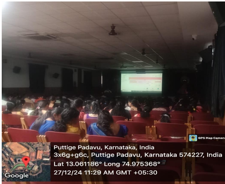
Session on Saral app