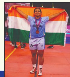
Dhanalakshmi Winner of 2 nd World Cup Kabaddi Tournament held in Bangladesh 2025