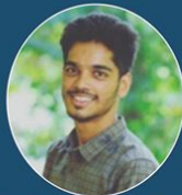
CA VIKAS I ANCHAN 2019 16 th