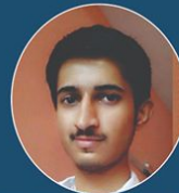
CA RAGHAVENDRA 2019 33 th