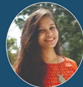
SPOORTHY D C 2020 24 th